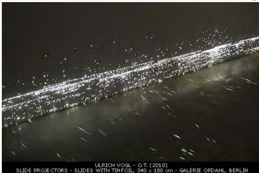
ULRICH VOGL - O.T. (2010) SLIDE PROJECTORS - SLIDES WITH TIN FOIL, 340 x 180 cm - GALERIE OPDAHL, BERLIN