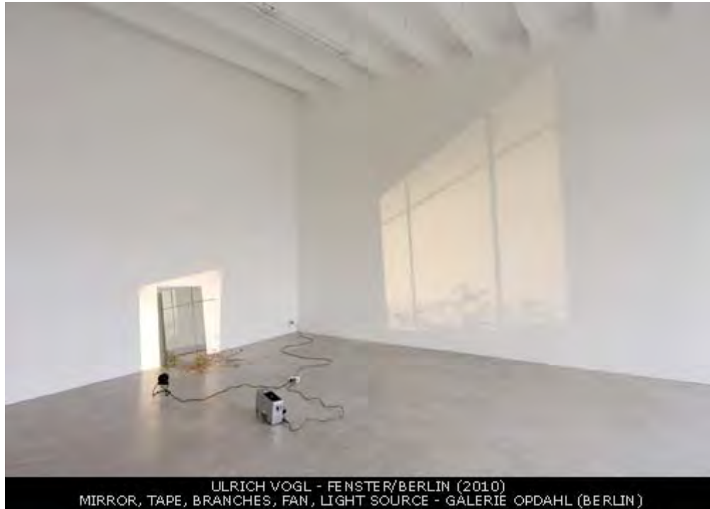
ULRICH VOGL - FENSTER/BERLIN (2010) MIRROR, TAPE, BRANCHES, FAN, LIGHT SOURCE - GALERIE OPDAHL (BERLIN)

Silvia Scaravaggi: Drawing is also a basic component of your practice. What does Extension of Drawing mean?